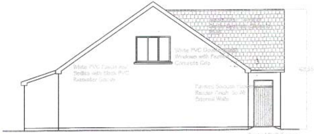
4 Main Building East Elevation 202 Scale 1:50